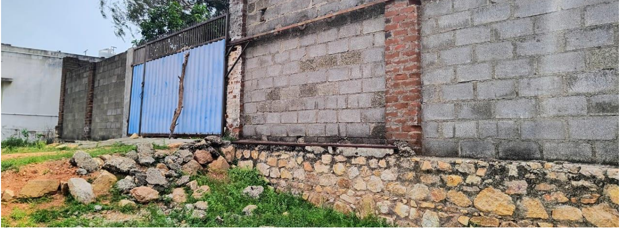
Backside open land: Can be utilised if required later.